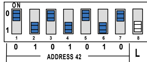
Figure 1: Example of Sounder Addressing and Sounder Output Level Setting

The address of the sounder is set using seven segments of the eight- segment DIL switch. The eighth segment is used to adjust the sounder output level. Segments 1- 7 of the switch are set to “0” (ON) or “1”, using a small screwdriver or similar tool. A complete list of address settings is shown in on Page 3. If a detector is to be fitted, set the Xpert Card address as described on Page 2.