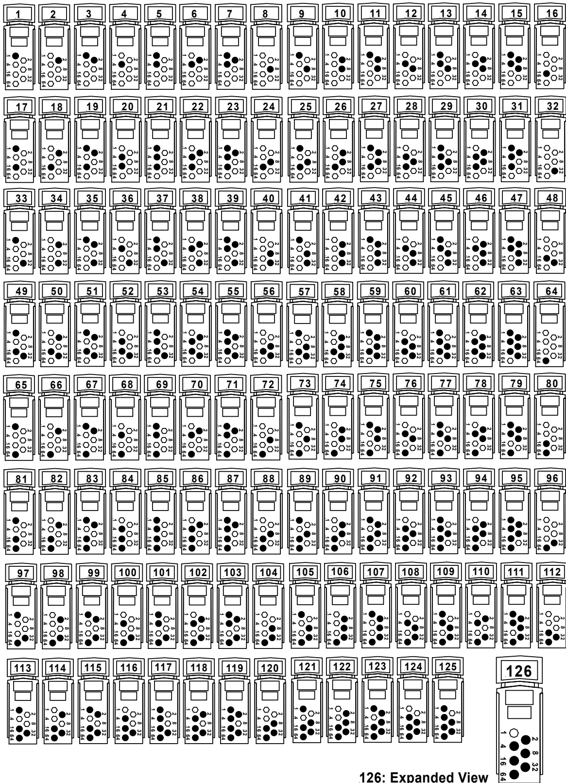
126: Expanded View

Select the desired address and remove the pips indicated in black. Remove pips with a small screwdriver.