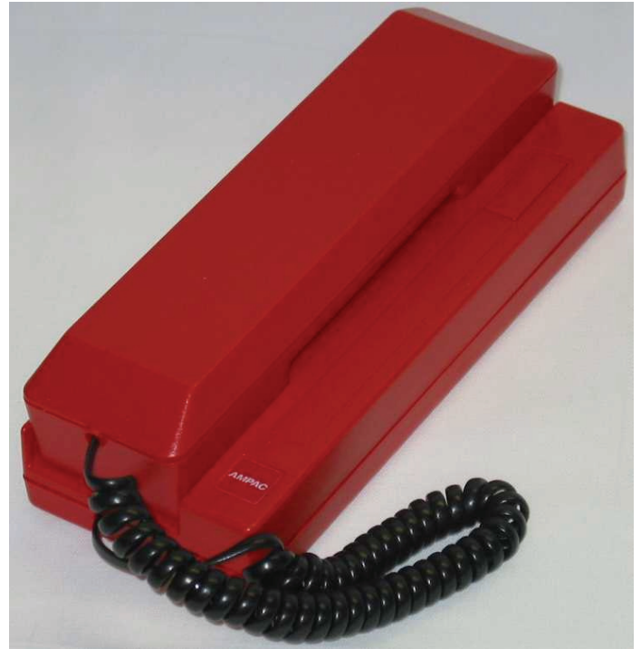
Figure 1: 3 Wire Warden Intercom Phone

Every WIP is supplied with an End-Of-Line Resistor. If an EAID is installed, the resistor must be relocated and used as a terminator.