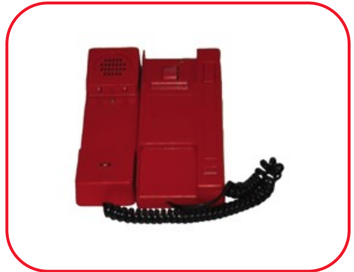
Figure 1: 3 Wire Warden Intercom Phone

Every WIP is supplied with an End-Of-Line Resistor. If an EAID is installed, the resistor must be relocated and used as a terminator.