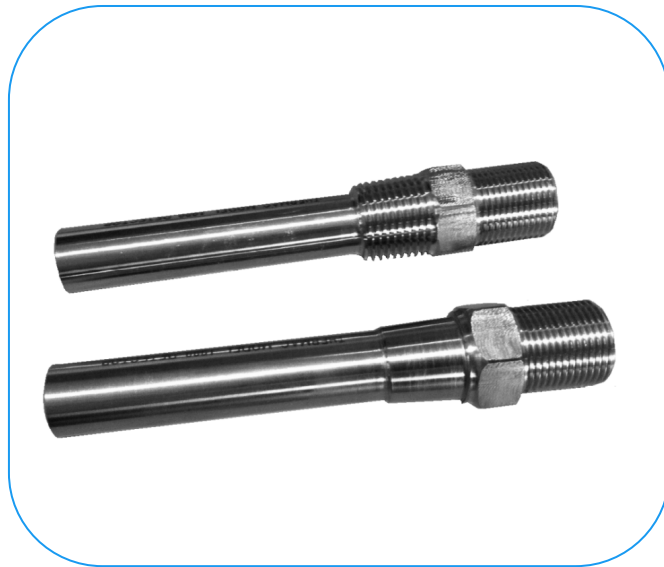
Type E Heat Detector