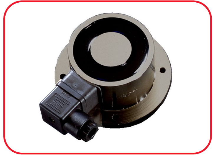
Surface Mount Door Holder