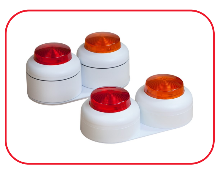
Dual LED Beacons (shallow & deep base)