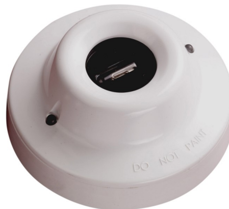
Series 65 Base Mounted UV Flame Detector

If fitting to an XP95 Zone Monitor do not fit more than one device per zone.