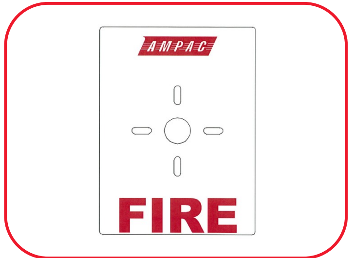
4210-0048 Vantage Sounder Beacon Plate