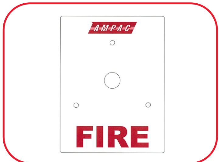
4210-0049 ASL 86 Strobe Plate