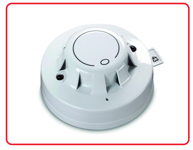
Carbon Monoxide Detector