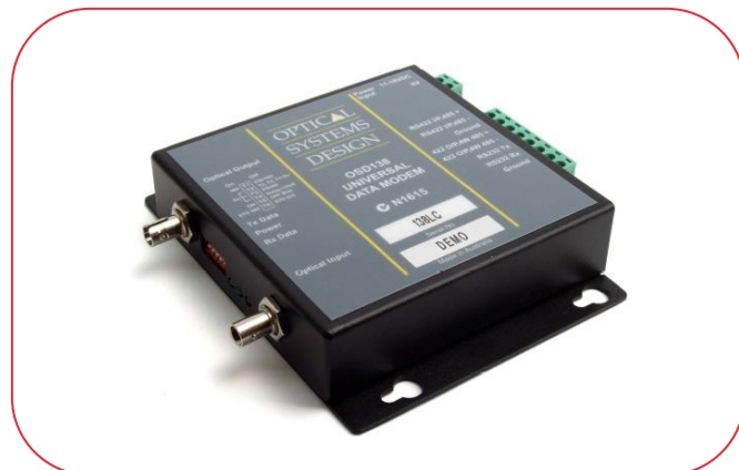
Figure 1: OSD138 Universal Data Modem