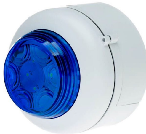
Vantage LED Beacon