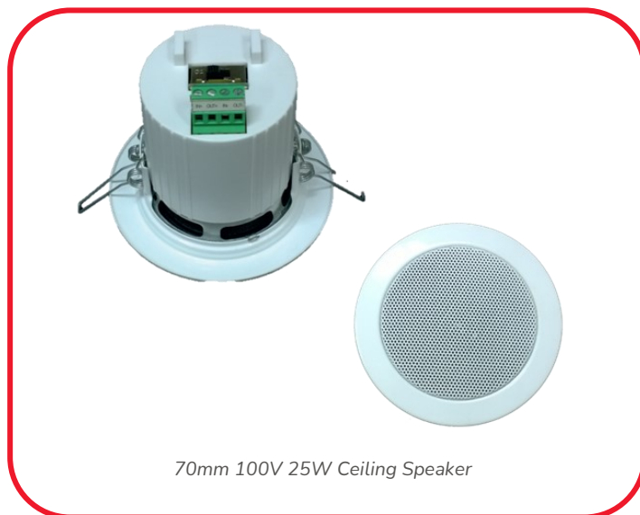
70mm 100V 2.5W Ceiling Speaker

The 70mm ceiling speaker is ideal for use in a wide range of applications including Emergency Warning Systems (EWS), Background Music (BGM) and Public Address (PA) paging within offices, warehouses, hotels and shopping centers.