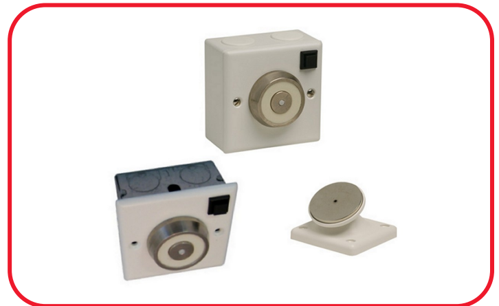
Flush Mount Door Holder