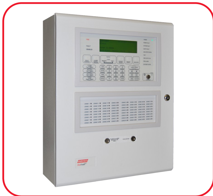
FireFinder Plus SP1M Control Panel

The FireFinder Plus is available in four standard cabinet options.